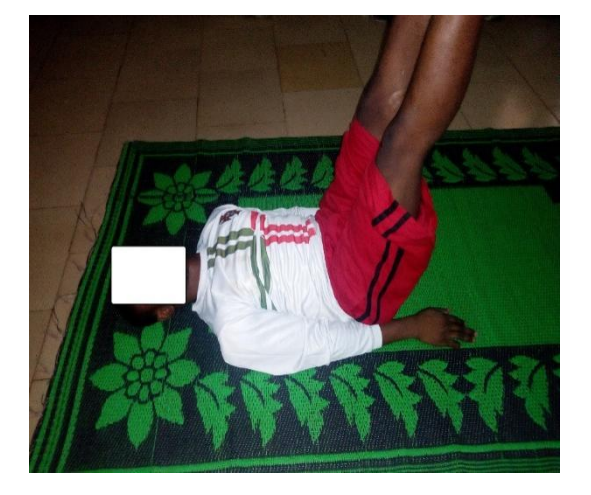
Figure 3: double straight leg raise.