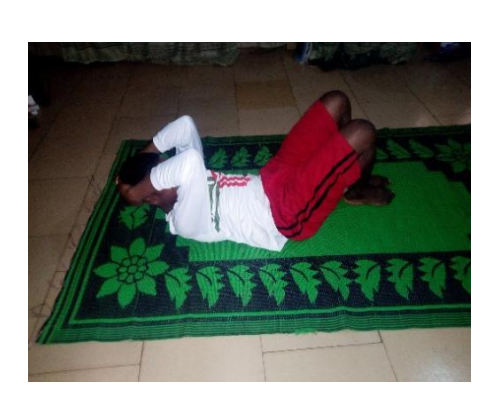
Figure 2: abdominal crunches.